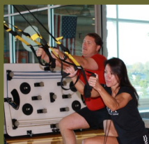
TRX Suspension Training

Get started with personal training today.