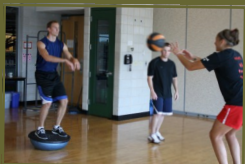
Sports Performance Training