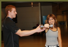
Reach your goals!